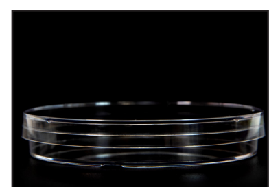
Lid designed for optimum stack stability