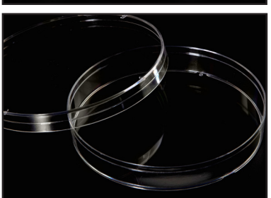
Manufactured from virgin-grade polystyrene for optimum clarity and quality