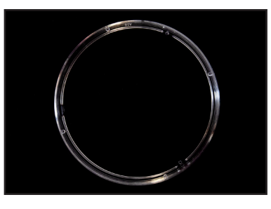
Ventilation ribs allow for free air circulation and reduce condensation during incubation