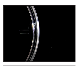
Two marked compartments for easy identification