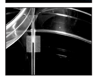
Raised partition for automation equipment

ISO mark target for orientation in automated filling and streaking equipment