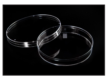
Manufactured to the highest quality for consistent flatness and even media distribution