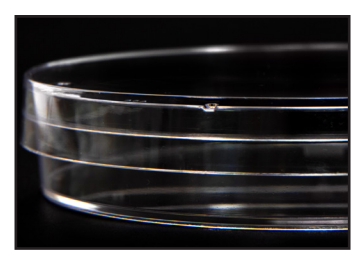
Specially designed "slippable" lid is ideal for use in automated equipment