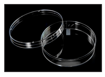
Specially designed "slippable" lid is ideal for use in automated equipment