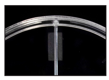
ISO Mark Target for orientation in automated filling and streaking equipment