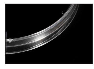
Low profile dish saves space in incubators and storage