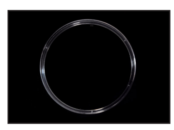
Manufactured from virgin-grade polystyrene for optimum clarity and quality