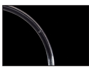
Ventilation ribs allow for free air circulation and reduce condensation during incubation